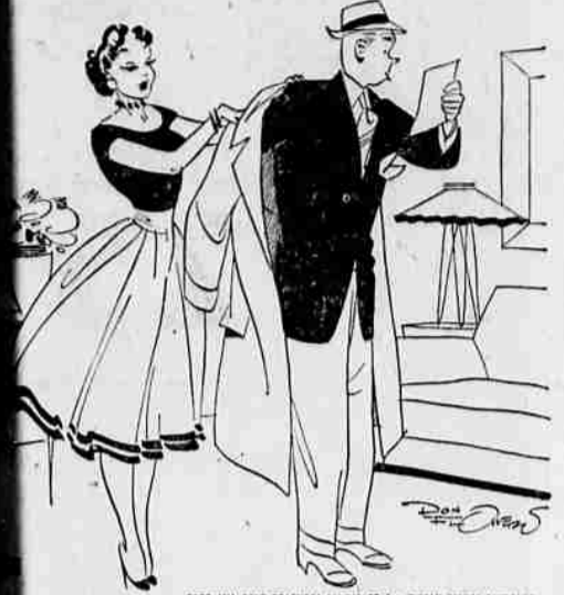
What kind of a market list is THIS?! Bread, cereal, tomatoes, can of peas, mink coat—!"