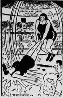
"It's certainly sweet of you to notice that I've lost weight, Grace!"