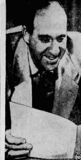
SUITS HIM — Country Slaughter is pleased with the 1954 contract given him by the St. Louis Cardinals. The outfielder will be 38 when another season rolls around.