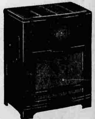
REG. 79.95 OIL HEATER

Reg. Price 10.95 to 22.00. Chrome dinette chairs. Wide assortment. Some foam rubber cushions. All colors.