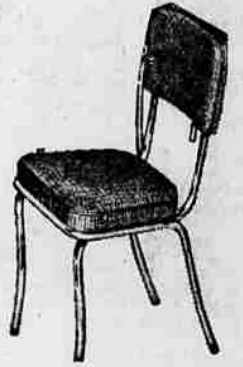
CHROME DINETTE CHAIRS

More savings when you buy in a group. 18th Century styling. Mahogany veneer tops, balance selected hardwood, with raised moulded top edges, serpentine shaped rails. Beaded moulding on aprons.