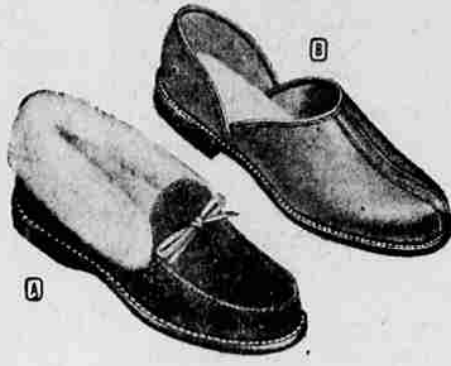
MEN'S FAVORITE SLIPPERS

ST. JOSEPH ASPIRIN FOR CHILDREN ONLY THE BEST IS GOOD ENOUGH FOR YOUR CHILD