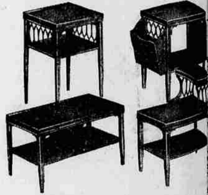
REG. 13.95 TO 15.95 TABLES

5-pc. plastic-chrome set cut for extra savings during Ward Week. 36 x 48-in. top extends to 60 in. Chairs have foam rubber seats, non-marring backs. REG. 14.94 Matching Chair, now only. 13.88