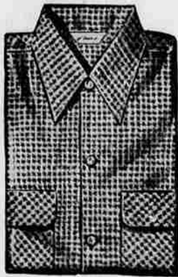
COTTON FLANNEL PLAIDS

Full size, with a single control. The same quality sells nationally for 34.90. A soft, sturdy blend of 75% wool, 25% cotton. 9 temperature ranges. TWIN SIZE, single control. Usually 32.90... 27.50