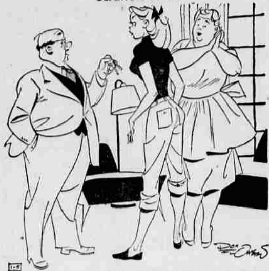
"You're a big girl now, so here are your keys to the front door, the refrigerator and the television."