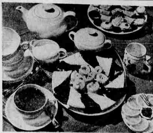
TEA PARTIES ARE FUN and provide a delightful way to entertain drop-in friends. Tea can give that needed pick-up and adds a party note when accompanying tray of simple sandwiches and cookies.

We have come just about full circle in this business of careers for women. Back in the 20s we were fighting tooth and nail for the right to do men's jobs for men's pay. Emancipation was the