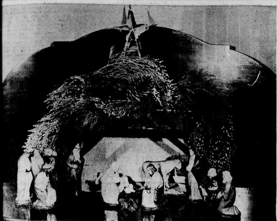
AND SHE BROUGHT FORTH her first-born son and wrapped him in swaddling clothes and laid him in a manger: because there was no room for them in the inn."