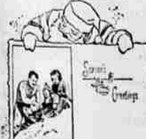
Photo Greeting Cards

We'll make them from your own snapshot negative. Wide selection of new card designs. Stop in now.