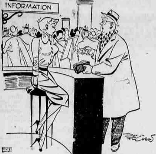
"And if she comes in here, tell her you haven't got any fur salon."