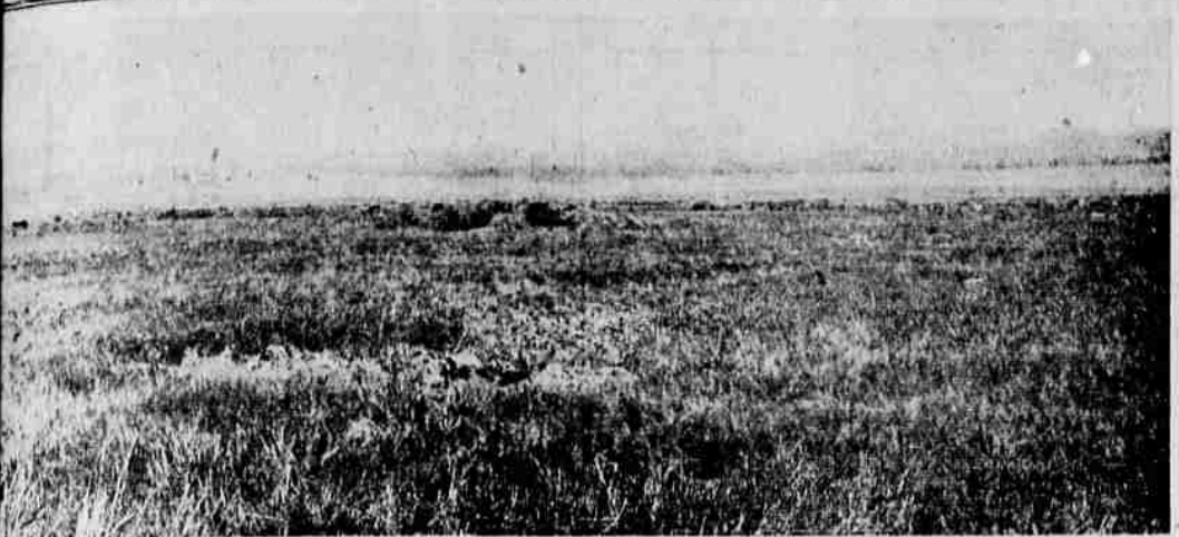
BEFORE DRAINING AND LEVELING, Gerber's ranch included several hundred acres of land such as this. Poor drainage made this meadow a veritable swamp until late in the summer.