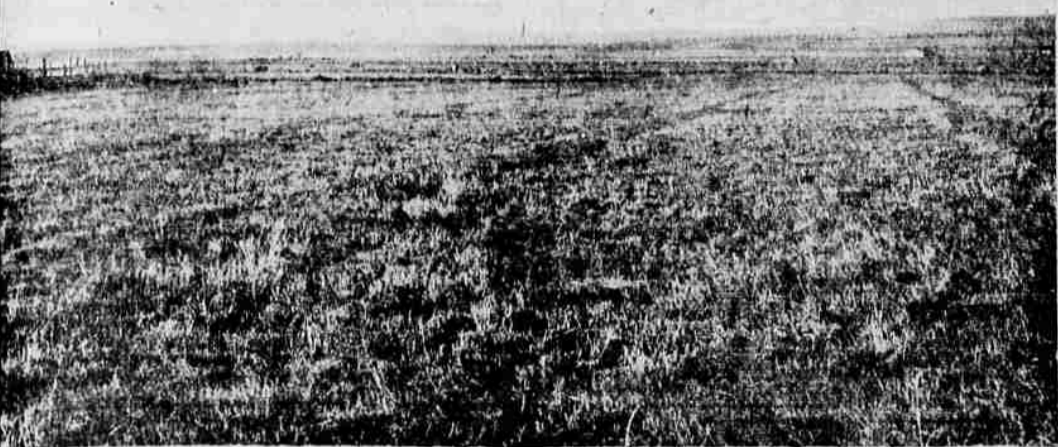
AFTER DRAINING AND LEVELING the low land looks like this. Picture shows a three year old alfalfa field, leveled and complete with irrigation borders. This field now produces more than four times the hay cut before reclaiming.