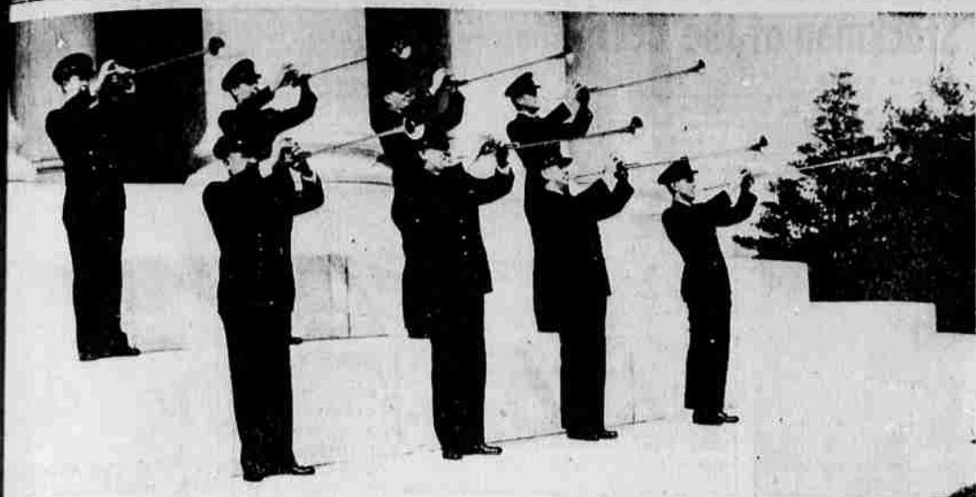
LONG, REEDLIKE INSTRUMENTS of ancient lineage, the famous Herald Trumpets, will be featured by the United States Navy Band when it appears in matinee and evening concerts at KUHS Pelican Court, Saturday, Oct. 24. The trumpet is one of the oldest musical instruments and reference is made to it in the Bible. Music lovers will have an opportunity to see and hear this unusual presentation during the concert.

sponsored by the KUHS Band benefit performance. These trumpets give a splendor to the band performance by their charm and the incisive quality which they lend to the brasses. The eight performers on the Herald Trumpets are soloists of distinction. Funds from the two performances will be used to purchase new band uniforms.