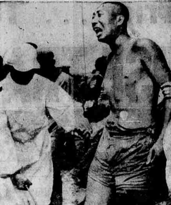
A DEMONSTRATING Chinese soldier screams as he is led away at the Panmunjon exchange point by a Chinese doctor (left). The Chinese Communist soldier was one of 65 POWs who were repatriated at their request. Note tattoos on returnee's arm. Several of the returning prisoners charged the United Nations with forcible tattooing.

By CAROL CURTIS No embroidery necessary on these hilarious vegetable motifs—the "musical vegetables" are in crimson and leafy green—the color is right in the transfer! Twelve motifs of 3, 3½ and 4 inches to use on kitchen towels, breakfast cloths, potholders, curtains or on gay gift aprons. Not illustrated are a green pea brass band quartet, ear of corn with a big horn; a fat cabbage lady with a concertina; pattern contains an amusing assortment. Send 25c for the Musical Vegetables Transfers (Pattern No. 827 all transferring and laundering instructions, your name, address, pattern number to Carol Curtis, Herald and News, Box 229, Madison Square Station, New York 10, N.Y. Patterns ready to fill orders immediately. For special handling of order via first class mail include an extra 5c per pattern.