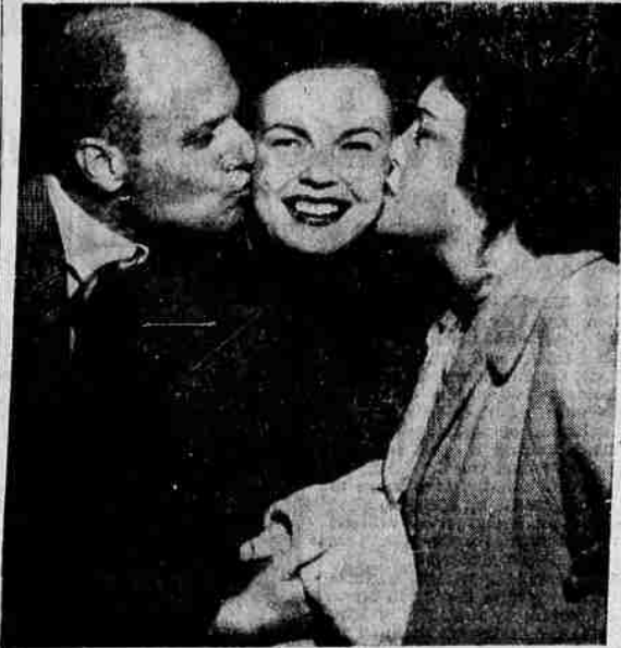
RETURNS HOME —Former actress June Haver (center), who gave up a film career to become a nun, is kissed by her stepfather and mother on her arrival in Los Angeles. She left the convent in Kansas for a rest. She said she had been in a hospital in Kansas City recently because her health had been failing.

HEADING THE 1954 HUDSON LINE is the Hudson Hornet, national stock car champion, which has demonstrated its outstanding performance and durability in competition on the nation's race tracks. The '54 Hornet has a lower and longer appearance, and luxurious, Salon Lounge interior. Its "Instant Action" engine with Super Induction develops 160 horsepower. With Twin H-Power, Hudson's popular multiple fueling system, the Hornet engine delivers 170 horsepower. Hudson Power Steering and improved power brakes are available as optional equipment. All '54 Hudsons have "step-down" design and low center of gravity and the durability and safety provided by Monobilt body-and-frame construction. The new Hudsons are now on display at Juckeland's, 11th and Klamath.