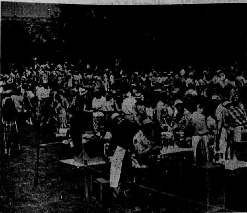
A CROWD ESTIMATED AT 3000 attended the Elks picnic at Melin park last Sunday, filled up on barbecued beef, beans and refreshments, played games and in general had a fine time. The picture here shows some of the throngs lined up at the chow tables.

BERLIN (AP) — Operation Kinderlift got underway Monday, a unique German-American venture for refugee children (Kinder). Twelve U.S. Air Force planes carried 300 boys and girls from Berlin to West Germany for a month's free vacation in German homes and German Youth camps.