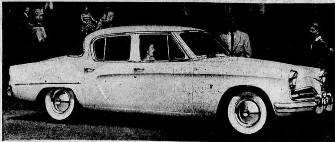
Commander V-8 Land Cruiser. White exterior, chrome wheel discs—and glare-reducing tinted glass—optional on all models at extra cost.

It announced Wednesday that those with three years service, which may include previous tours in any U.S. military branch, may apply for release Sept. 15 if they are not serving in critical categories.