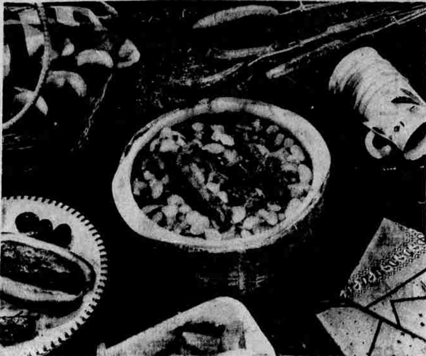
EVERYTHING FOR THIS PICNIC except the final grilling of the hot dogs was done at home. Hearty casserole uses plentiful western large dry lima beans, flavorfully seasoned. Casserole is wrapped in several thicknesses of newspaper to keep piping hot.

by all sliced fresh peaches served with chilled custard sauce. Add a dash of grated lemon or orange rind to the sauce for extra flavor. To make it party fancy, serve on slices of angelfood cake... or any cake.