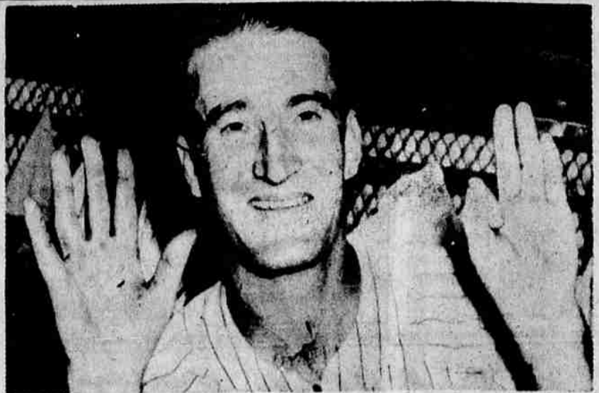
MAKE IT EIGHT: Washington pitcher Bob Porterfield holds up eight fingers—one for each of the shutouts he has thrown this season—in team dressing room at Washington after game with Boston. He became the first Nat pitcher since Walter Johnson, in 1924, to pitch eight shutouts.