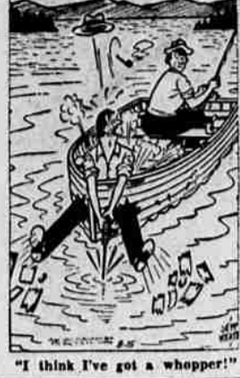
"I think I've got a whopper!"