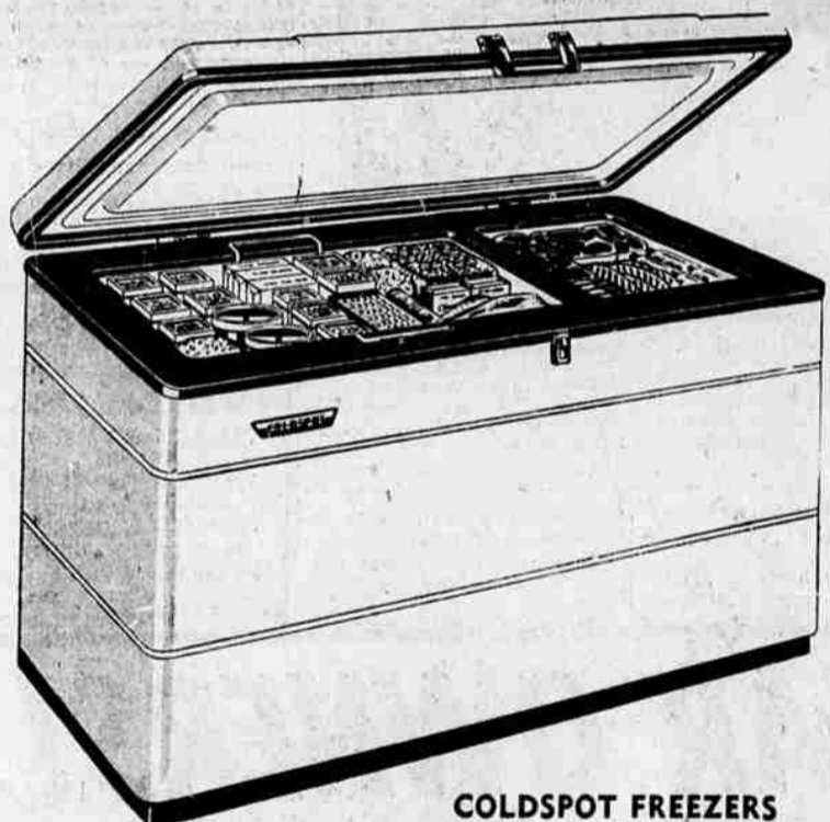
COLDSPOT FREEZERS Available in Chest or Upright Type

Gleaming Coldspot becomes the store in your home that never closes. Freezes and stores 679 lbs. of all types of food. Exclusive Super-Wall construction eliminates moisture collection on outside. Save extra during August Sale for Homes . . . buy this quality Coldspot Freezer at special purchase savings! Buy Coldspot and start living better today!