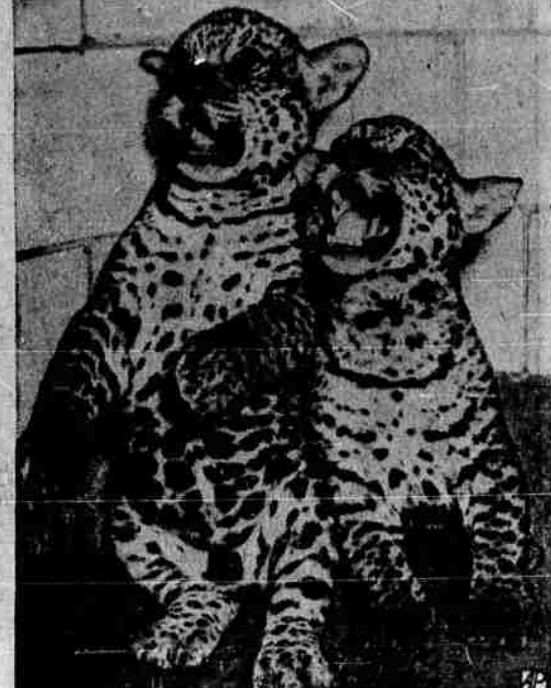
KITTEN CONCERT - Baby jaguars, born in Central Park Zoo, New York last May, offer a duet at their introduction to public. Not yet named, they're offspring of Brazilian jaguars.