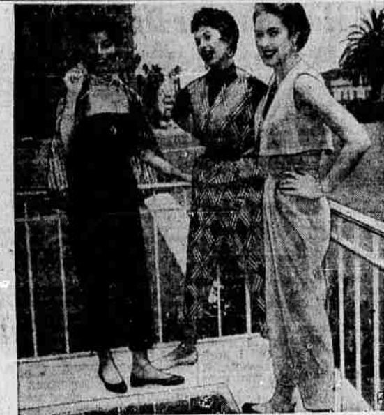
AT EASE WEAR - California's latest leisure wear includes, left to right, strapless coverall with jacket; tapered slacks and matching jerkin; and one-piece suit with bolero.