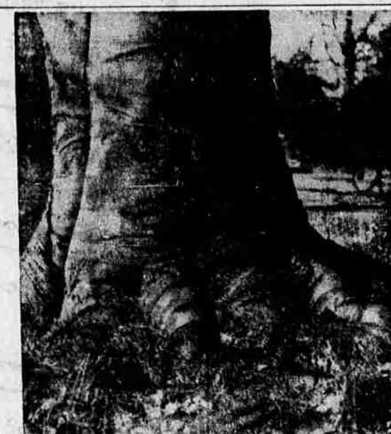
ELEPHANT TREE - This is an elephant tree, according to photographer Verner Z. Reed, of Charles River, Mass. He found the tree in the vicinity of Newport, Rhode Island.