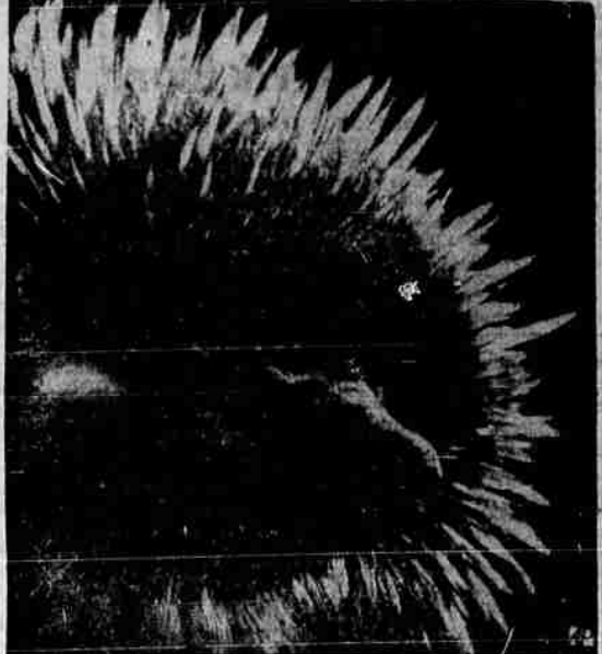
MEET THE ECHIDNA - Latest addition to the Frankfurt, Germany, Zoo, is this echidna, or porcupine ant-eater. Of Australian origin, its coat is a mixture of hair and spines.