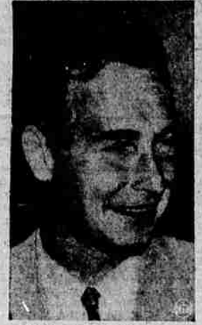
VEEP'S AIDE —Christian A. Herter, Jr., son of Governor Herter of Massachusetts, has been named administrative assistant to Vice President Richard Nixon. Herter, a member of the Massachusetts House of Representatives, resigns to take the Washington job.

RAEFORD, N.C. (AP) — The head-on collision of a speeding automobile and a truck near here Friday night killed five youths returning from a religious meeting and a passenger in the truck.