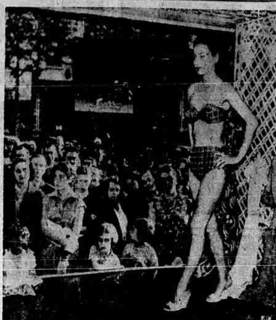
A CROWD stands outside a Paris dress shop, attracted by the novelty of a live mannequin and the costume she is modeling. The shop is using girls instead of the usual store window dummies to display its line of bathing suits.

7:30 News 7:45 Farm Markets 8:00 Bulletin Board 8:15 Hollywood Serenaders 8:30 News-Mid Morning 8:45 Harmony Shop 9:00 Music with Your Meals 9:15 American Folk Music 9:30 Morning Melodies 10:00 News 10:15 Sports 10:30 Club Meetings 10:45 Concert Time 10:55 Tune Up in Health 11:00 Western News in Brief 11:15 UP Commentaries 11:30 Names in the News 11:45 Accent on Melody 11:55 Musical Roundup 12:00 Eddie Lamar 12:05 Sports Page 12:15 Lake County News 12:30 World News Roundup 12:45 Parade of Hits 12:55 Under the Capitol Dome 1:00 Alger Theatre 1:25 Mystery Time 1:30 Late Soil Cons. Dnt. 1:45 Pastoral Call 1:50 Organ Moods 1:55 Melody Club 2:00 News 2:05 Listener's Choice 2:30 News-Sports 2:35 According to the Record 2:45 Jan Garber 2:50 American Band 3:45 Man From Dixie 4:00 News 4:15 Calling All Fishermen 4:30 Pop Preview 4:45 Rene Savard Orch. 5:00 Sign Off