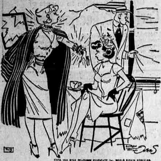
"One thing I'll say for Spike—he's a good provider."