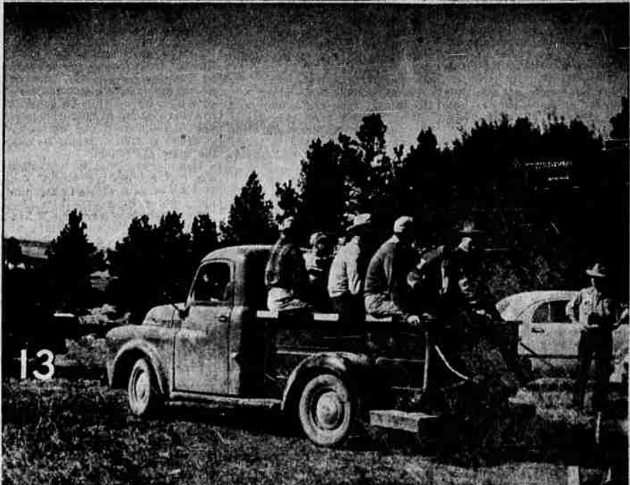
"OH GIVE ME A HOME, FAR AWAY FROM MY WIFE," will be the opening refrain ringing through the tall pines the weekend of July 24-26 when some 400 men, minus guns, dogs and women, take off for the annual Hart Mountain trek. Pictured here are a few scenes from last year's party. (1) Signpost in the desert gives you directions with a perky antelope up on top to point the way Eastward to the camp. (2) This sign isn't kidding. It's been known to happen. (3) Dining facilities