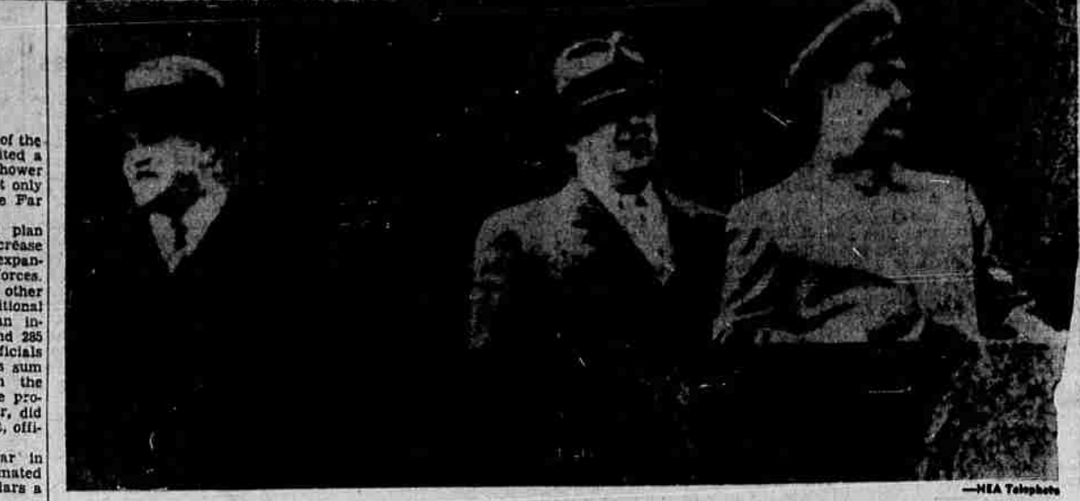
AND NOW THERE ARE TWO—The Soviet triumvirate that took power after Stalin's death now has been reduced by axing of Lavrenti Beria, head of security police. The three are pictured in earlier days: left to right, Molotov, Beria and Malenkov.