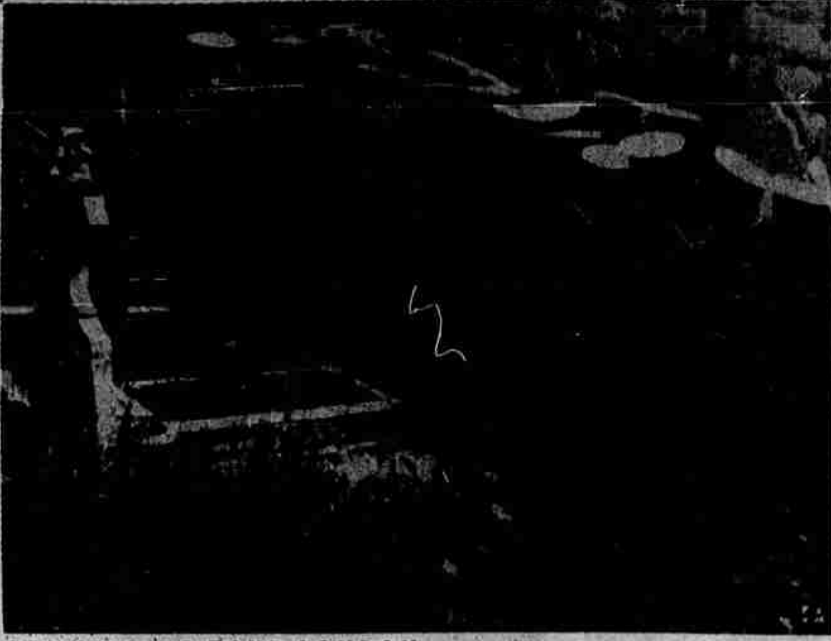
RED SAILORS TOUR LONDON — Grave of Karl Marx, father of modern Communist philosophy, was first stop on embassy-arranged London tour for visiting Soviet sailors.