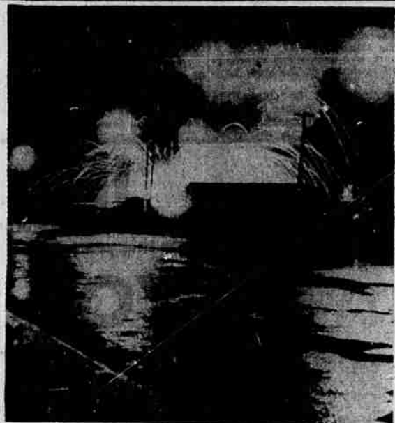
AMMO EXPLOSION —Blasts and flames continue to light up the sky July 5 after ammunition dump at an Army anti-aircraft station exploded during a thunderstorm in Chicago. Police evacuated persons from nearby houses for fear they might be injured. Officials said the explosion was apparently caused by a lightning bolt.