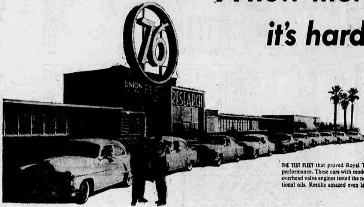
THE TEST FLEET that proved Royal Triton 5-20's amazing performance. These cars with modern high-compression, overhead valve engines tested the new oil against conventional oils. Results amazed even laboratory technicians.

A new motor oil so GOOD it's hard to believe!