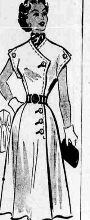
9223 SIZES 12-20 by Marjorie Martin

Spring news! See the coldress influence in this smart, step-in dress! So dashing—its buttons all the way over to one side! So dramatic—point up the neckline with contrast-color scarfs. Note the button trim on the sleeves, flatteringly flare of the skirt. Pattern 9223: Misses' Sizes 12, 14, 16, 18, 20. Size 16 takes 3 1/2 yards 39-inch; 1/2 yard contrast; this easy-to-use pattern gives perfect fit. Complete, illustrated Sew Chart shows you every step. Send thirty-five cents in coins for each pattern if you wish 1st-class mailing. Send to Marjorie Martin, care of Herald and News, Pattern Dept., P.O. Box 6740, Chicago 80, Ill. Print your name, address, zone, size, style number.