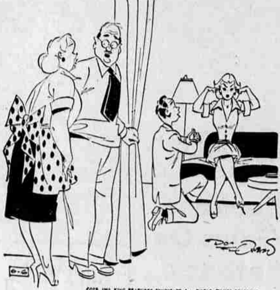
"You'd better give up the idea of a June wedding."