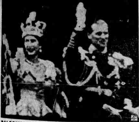
BALCONY GREETINGS — Queen Elizabeth II, wearing her newly received crown, and the Duke of Edinburgh, her husband, wave to thousands of persons from the balcony of Buckingham Palace on returning from her coronation.