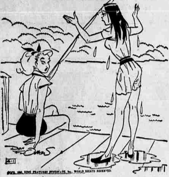
"Biggest fish I ever caught—but I got away!"