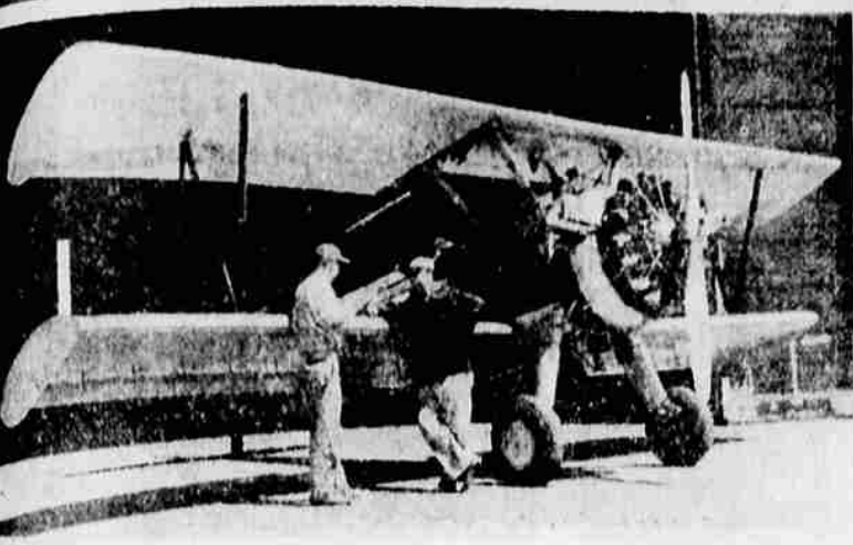
MULKEY AND CHET STINSON (l. r.) were well pleased with the performance of the "plane" above after Stinson had put it through a series of test hops. The plane is a Stearman trainer which Stinson Air Service made more adaptable to crop dusting through structural changes.