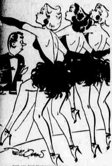
Now, but I think the girl on the end has a rip in her costume!"