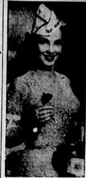
BUDDY POPPY GIRL — Actress Kathryn Grayson, above, has been chosen by the Veterans of Foreign Wars to be their Buddy Poppy Girl for 1953. Proceeds from the sale of the poppies go to disabled servicemen who make the artificial flowers.