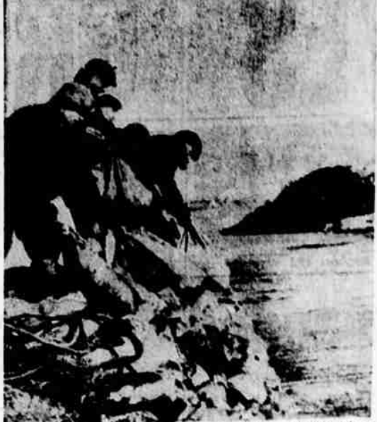
REPAIR SEA WALL — Racing against time, flood workers place sandbags into position on both sides of huge gap in sea wall near King's Lynn, England, as new gales threatened Britain's 300-mile danger zone. Three thousand servicemen have been added to the 9000 already on disaster duty in effort to build up gaps in sea walls.