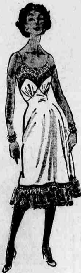
Sleeve in Pink, White, Sizes 32 to 42, $4.95; 44-46, $5.95 Second Floor