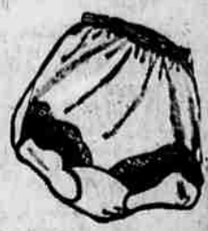
Brief in Pink, White, Sizes 4 to 7, $1.75