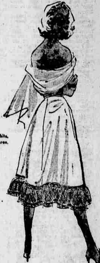
Petticoat in Pink, White, Small, Medium, Large, $3.95 Second Floor