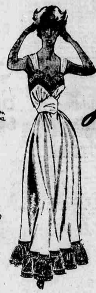
Gown in White, Blue, Sizes 32 to 42, $6.95; 44-46, $7.95 Second Floor

SPECIAL GET-ACQUAINTED OFFER! lavishly trimmed nylon tricot budget belles set