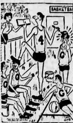
"Notice his holier-than-thou attitude since he made All-American?"