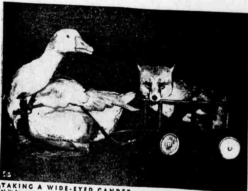
TAKING A WIDE-EYED GANDER — This harness-ed gander takes an uneasy look at its fox passenger during a piece of fowl play at Hamburg, Germany, poultry show. The presence of the fox at an exhibition full of its fowl prey caused many an apprehensive moment.