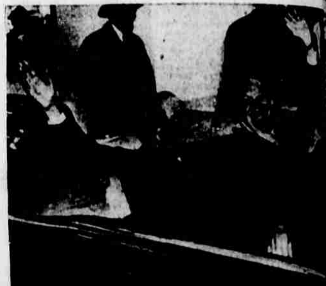
ON WAY TO CAPITOL — With smiles and a wave President Harry Truman and Dwight D. Eisenhower, leave the White House in an open car on way to inauguration ceremonies. In car with them are Sen. Styles Bridges (front) and House Speaker Joe Martin.