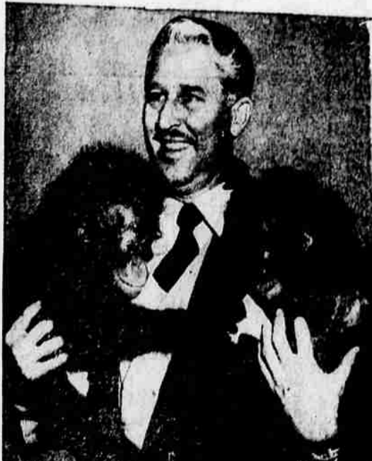
EXTRA-CURRICULAR ACTIVITY — Tong watches playmate Tong try to remove a handkerchief from pocket of Director Marlin Perkins in Chicago's Lincoln Park Zoo following arrival of the two-year-old orangutans from Singapore.