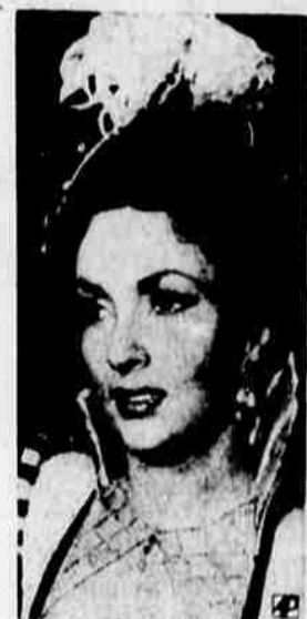
MALE TAMER — Italian actress Gina Lollobrigida is costumed for the leading female role in "Don Juan's Master," with Errol Flynn, which is being filmed near Naples, Italy.