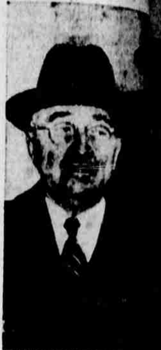
TRUMAN DONS A HOMBURG , Toggling the President Truman, steps into the inauguration ceremonies. Following him in the White House, Dwight D. Eisenhower breaks tradition when he elected to wear the usual top hat.