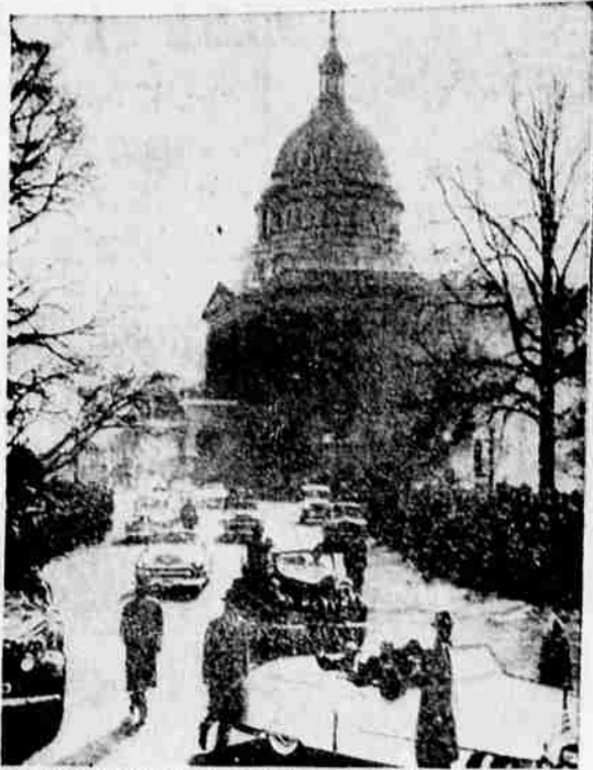
START OF INAUGURAL PARADE — Riding in an open car, the Dwight Eisenhowers lead the Inaugural parade from the Capitol grounds after swearing in ceremonies. Ike waves as car turns into Constitution Avenue. In background is Capitol dome.