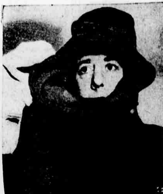
FOR RIGORS OF KOREA — This is not a medieval footman's headpiece but the new saten head covering to be issued to British troops in Korea. It buttons below the neck, is windproof and water-repellent, and has adjustable weather visor.