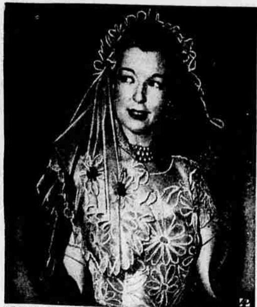
CORONATION HEAD DRESS — A model displays approved type of head dress for the coronation of Queen Elizabeth II. All ladies attending the coronation must wear on head a veil of any color except black and less than waist length.