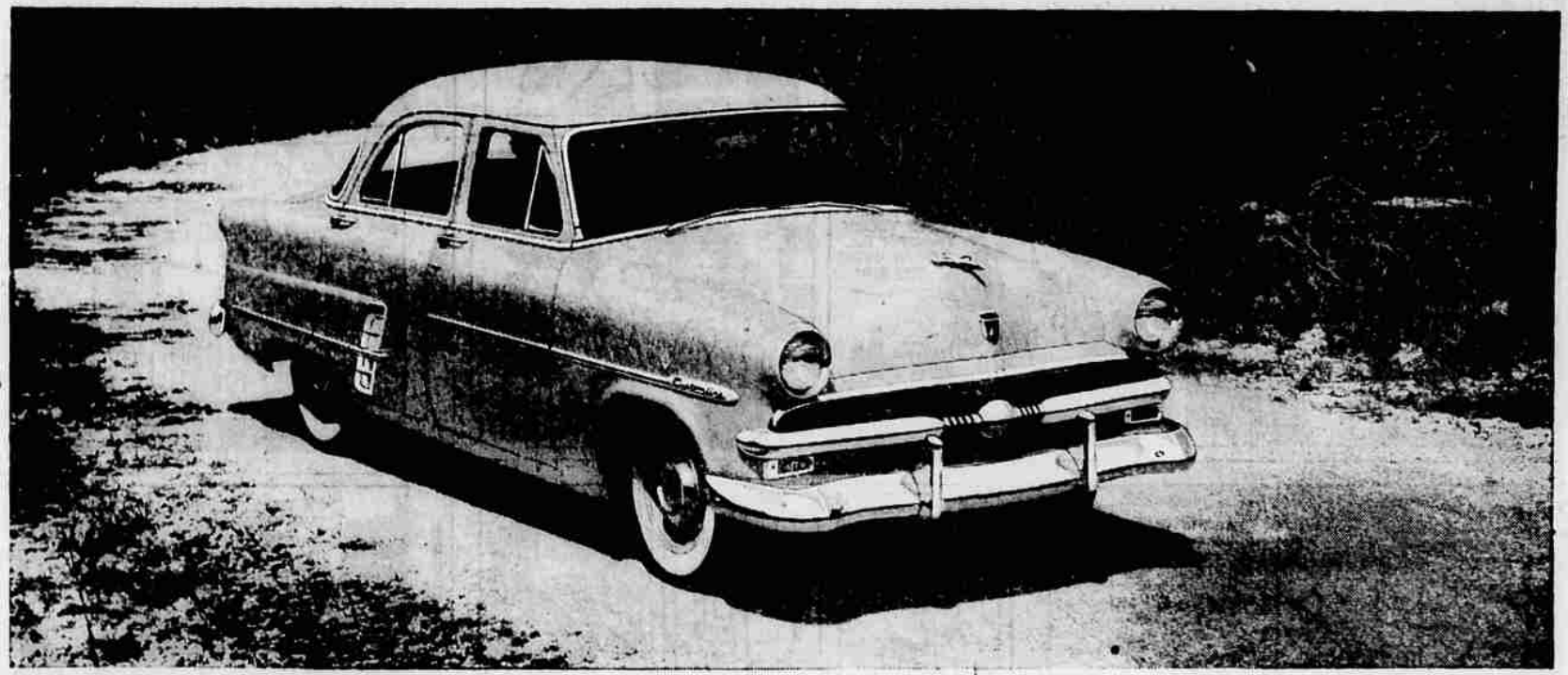
The New Standard of the American Road

If you've thought it takes gas-eating weight and hard-to-park length to give real riding comfort you ought to try this '53 Ford. For Ford's new Miracle Ride actually seems to lay a carpet of smoothness even over the roughest roads. There's no bounce, pitch and sway to bother you, no uncomfortable roll on curves. Ford's new Miracle Ride marks a new era of riding comfort and quiet. It's another big reason why Ford is worth more when you buy it . . . worth more when you sell it!