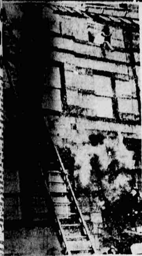
While two firemen rescue women at top other tenant sits on window sill as fire forces her to floor room. Visible under ladder in second window tenant waits rescue. Five persons were over-Boarding tenement fire but all responded to treat-