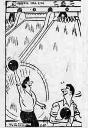
"Why, look, Ed! It's the boy from our block, who all week long has been pelting us with those icy snowballs!"