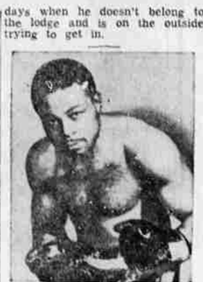
ARCHIE MOORE... he's in demand now