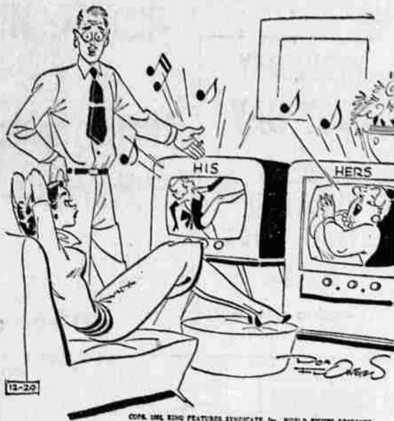
"Your idea isn't going to work, unless we both tune in the same channel!"