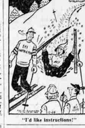
"I'd like instructions!"