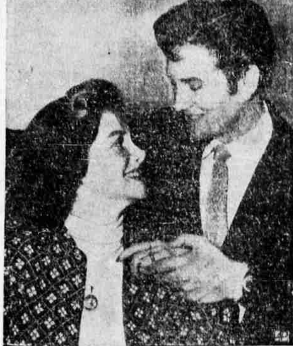
JOHN BARRYMORE JR. WEDS. John Barrymore Jr., showing the famed Barrymore profile, is pictured with his bride of day after their return to Hollywood (Dec. 23). She is the former Cara Williams, 24-year-old screen and television actress. Young Barrymore, 20-year-old son of the late star, is a $250-a-week actor at RKO. They met three months ago and were married at Las Vegas.