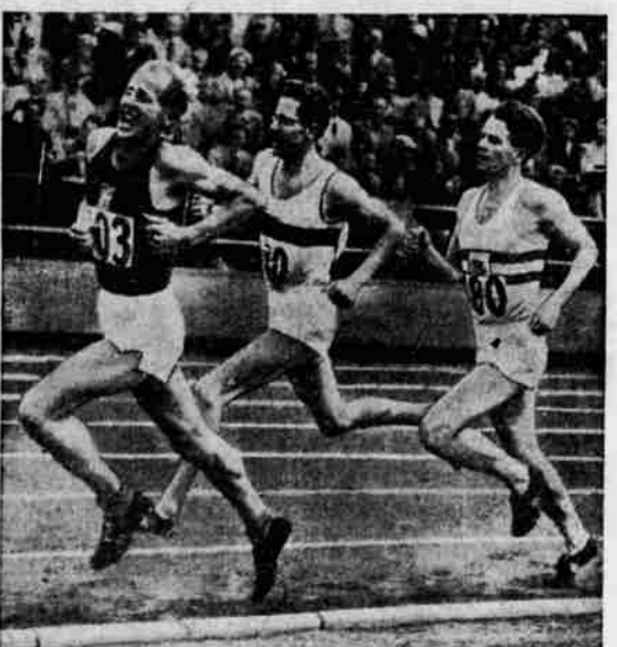
NO FORM BUT WINNING ONE —Czechoslovakia's Emil Zatopek leads two rivals to win Olympic 5,000-meter run, one of three long-distance races he won at Helsinki in July.