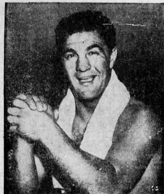
'FIGHTER OF THE YEAR' —Heavyweight champion Rocky Marciano smiles upon learning he won the Edward J. Neil Memorial Plaque, awarded annually to "fighter of the year."