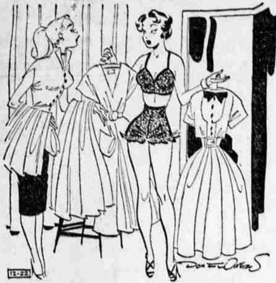
"You have all night to decide, Miss. The store closed an hour ago."