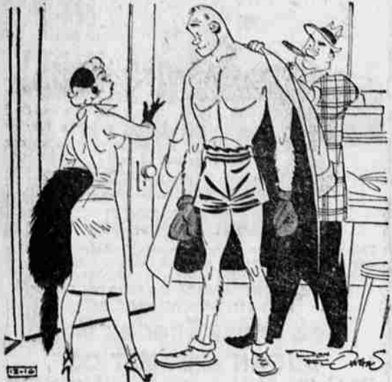
"And how much is the LOSER'S purse?"