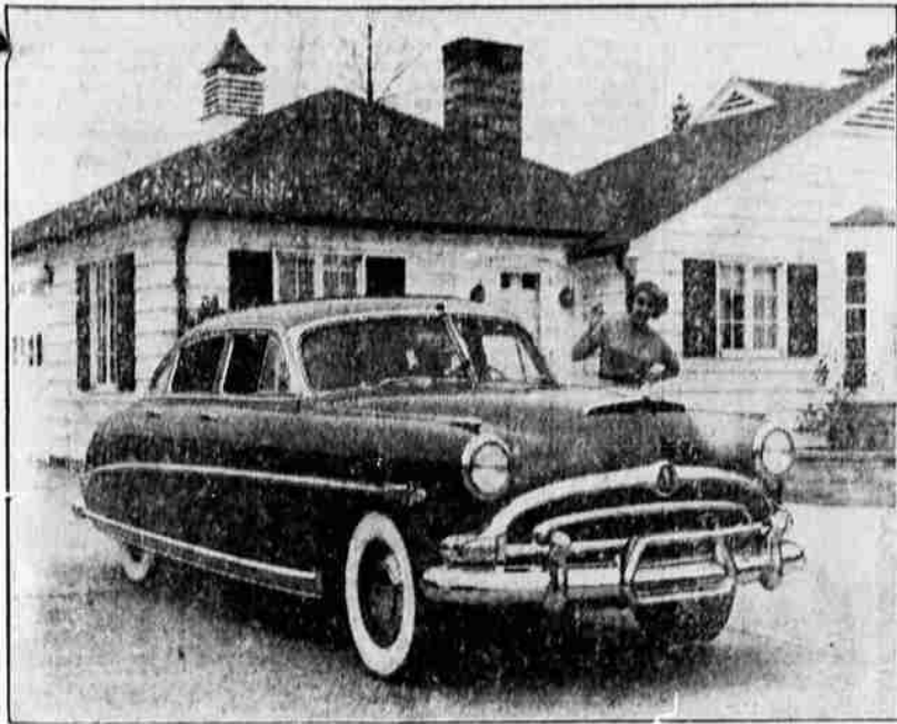
THE 1953 HUDSONS stress beauty, performance, durability. The 1953 Hudsons have sleek, low sweeping lines and a road-hugging appearance made possible only by Hudson's famed "step-down" design. Front ends have been restyled with modern, air-scoop-type hood ornaments blending into sleek hood lines. Luxurious interiors are decorator-planned to complement a wide range of new exterior car colors. Shown is the Hudson Hornet, record-smashing performer in stock car racing and holder of all national A.A.A. records for stock cars. The New Hudsons are now on display at Juckelund Motors.