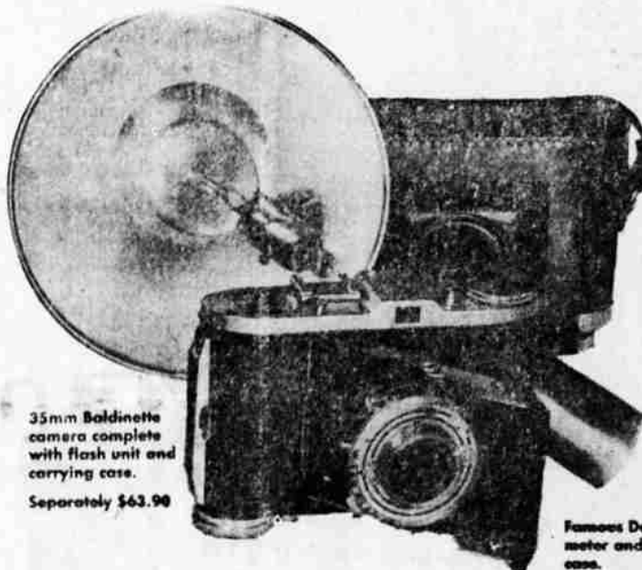
35mm Baldwinette camera complete with flash unit and carrying case. Separately $63.90