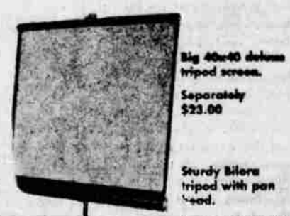
Big 40x40 deluxe tripod screen. Separately $23.00