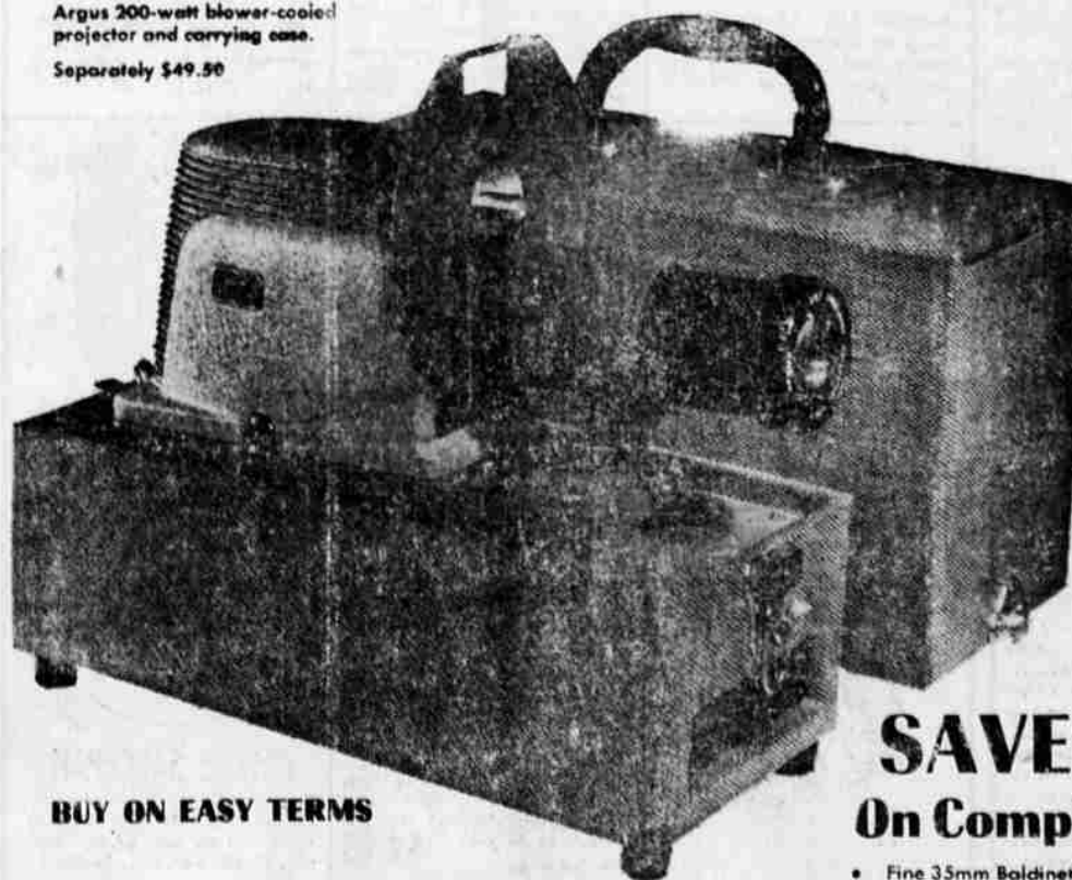
Argus 200-watt blower-cooled projector and carrying case. Separately $49.50