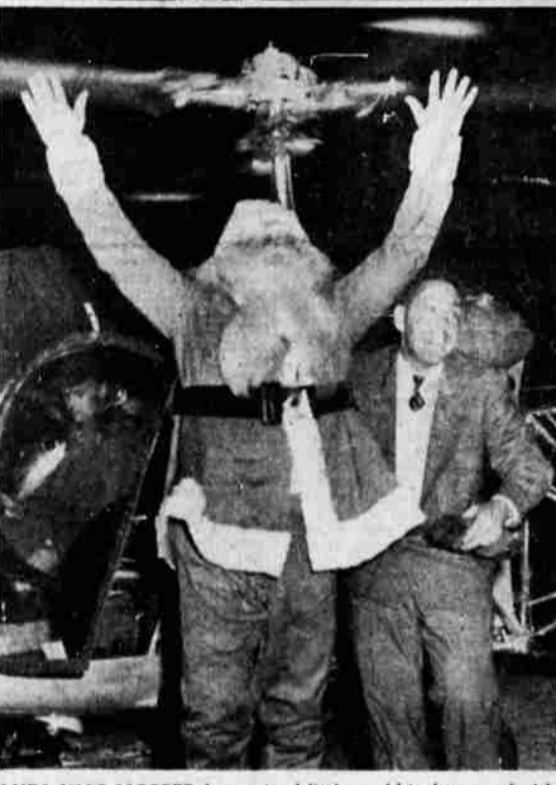
SANTA WAS MOBBED by excited little and big boys and girls (upper) as he swooped down to Modoc Field last night in a big helicopter to greet them at the big annual Klamath Merchants Christmas party. Lower left, the genial gent raised his arms to an estimated throng of 7000 who waited patiently in