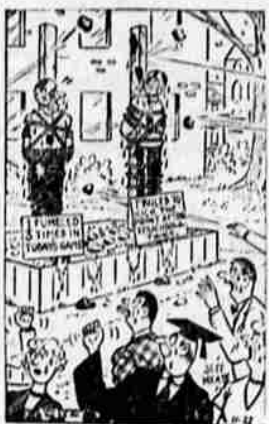
"Sometimes I think this college takes its football entirely too seriously!"