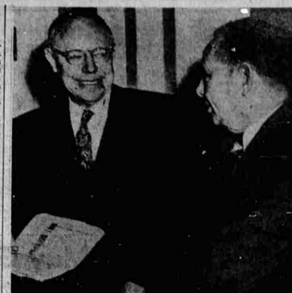
TALKING IT OVER. Senator Robert A. Taft (R.O.), left, confers with Representative Joe Martin (R. Mass.), probable Speaker of the House in the new Congress. Taft, who said it would be a "shame" to start the new Eisenhower administration off with a fight, will meet with other G.O.P. leaders in an attempt to reach an "amicable" settlement of the knotty Senate-Republican leadership question.

PORTLAND (AP) — Few states have a higher rate of tooth decay than Oregon, and the answer to this problem is to add fluoride to drinking water, the state dental health director said Thursday.