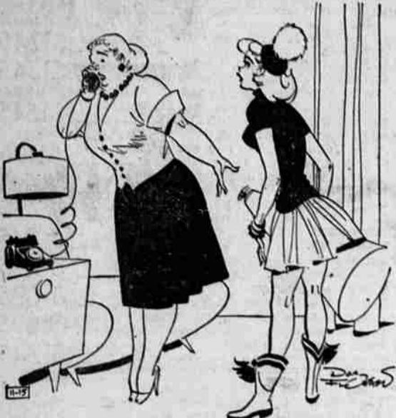
"Can't you send in an understudy or something? She's still hoarse from last week's cheering!"